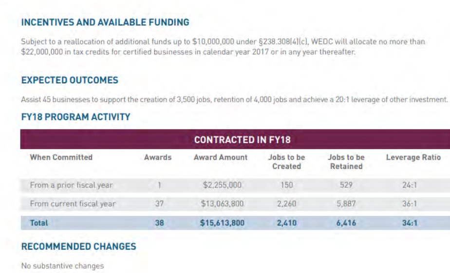
FIGURE 6. WISCONSIN'S ANNUAL GRANTS REPORT PROVIDES CLEAR FISCAL YEAR INFORMATION FOR EACH ACTIVE PROGRAM. EXAMPLE: REPORT FOR BUSINESS DEVELOPMENT TAX CREDIT 65